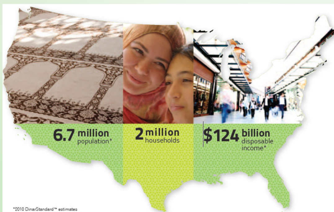
Figure 1: The US Muslim demographics

population are well positioned to address the geographic challenge, given their existing national channels and networks. By DinarStandard's estimation, fifteen states across the US represent approximately 85% of the total American Muslim population. These fifteen states run from coast to coast and are listed in descending order of their Muslim population size: California, New York, Texas, Illinois, New Jersey, Michigan, Pennsylvania, Maryland, Virginia, Georgia, Ohio, Massachusetts, Florida, Connecticut, and North Carolina.